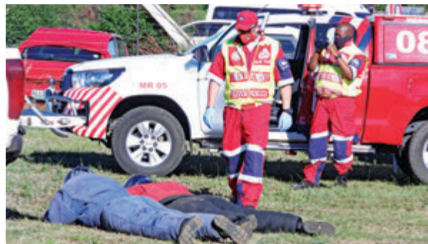
ER24 assist in a demonstration by HenCor K9 Security.