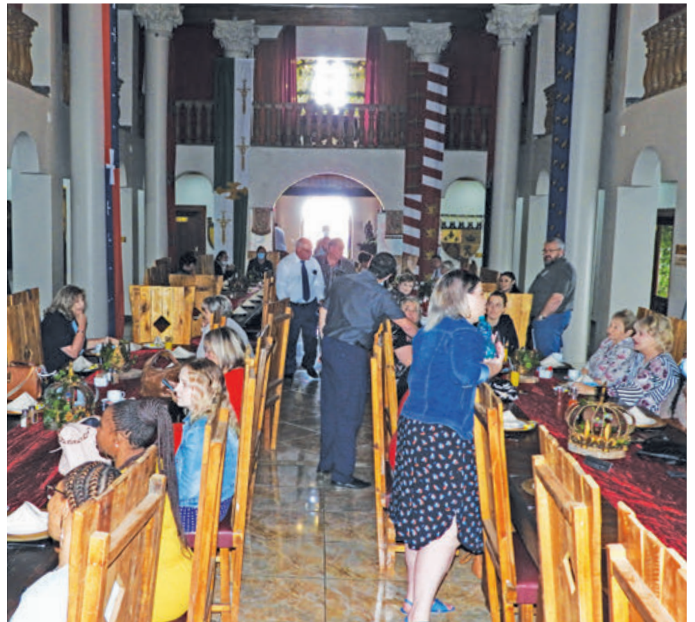
Several hearts of gold gathered in the name of Rustenburg’s youth.

Rustenburg – Rustenburg Child and Family Welfare hosted a networking breakfast at Excalibur Boutique Hotel on Friday 29 October. The event was attended by caring community members who all play a part in protecting, guiding and nurturing children. When working with the welfare of the youth, you often have to react quickly and knowing who to call in what situation is crucial. Representatives of schools, organisations, attorneys, police members and doctors had the chance to network over a scrumptious breakfast. The part that they play in our community is vital and this gave them an opportunity to meet likeminded individuals.