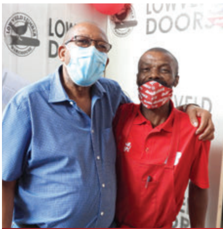
Providing exceptional client service.

Build it Platinum celebrated their b-day bash with their customers.