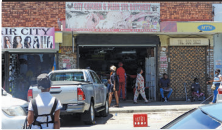
City Chicken & Plein Str Butchery in Rustenburg was robbed on Monday, 1 November.

Rustenburg – City Chicken & Plein Str Butchery in Rustenburg lost cash and meat to two armed robbers who stormed into the shop on Monday 1 November.