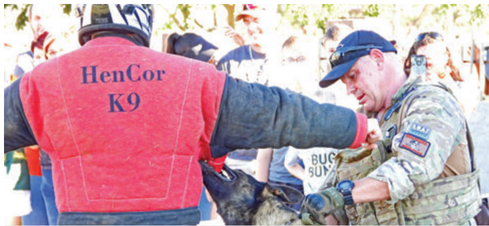
Arrow and Patschinka is trained in the disciplines of tracking, protection and detection.

The first is building our relationship with God and the second is to stand together," he said.