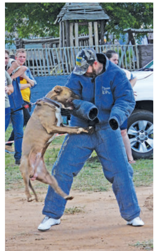
Bene in action.