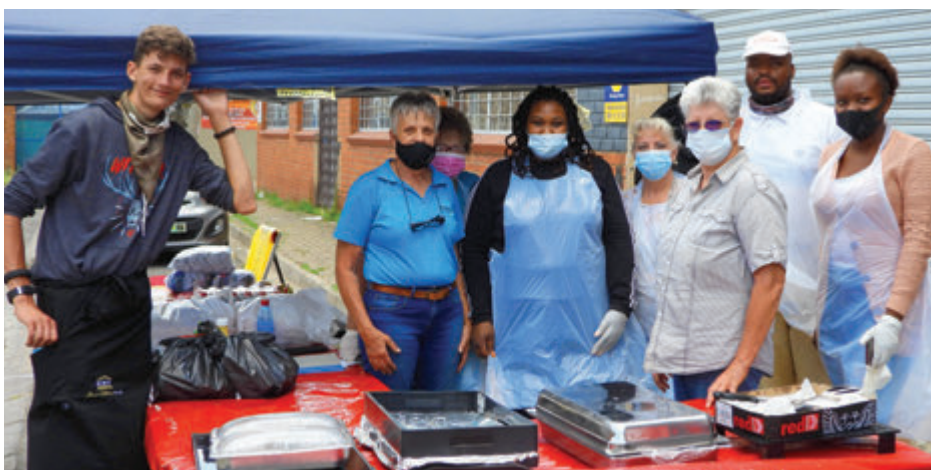
Hospice Rustenburg sold boerewors rolls to raise funds.